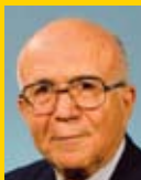
The Honorable Augustus F. Hawkins